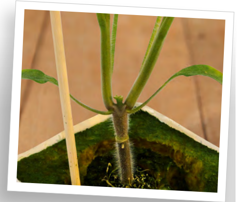
'Double' Grafted Plants - 1 plant, 2 stems, 1 variety