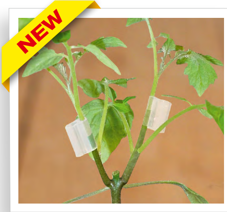
NEW 'Duo' Grafted Plants - 1 plant, 2 stems, 2 varieties!