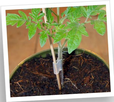
'Single' Grafted Plants - 1 plant, 1 stem, 1 variety